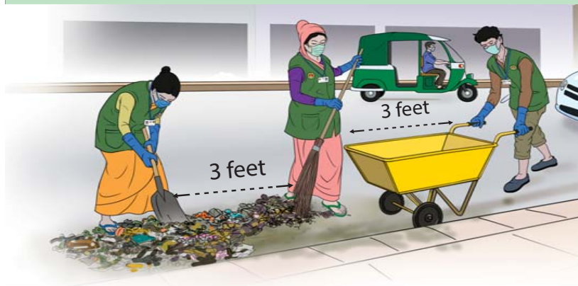
While at work

Always maintain at least 1 meter distance from other cleaners as well as from other public.