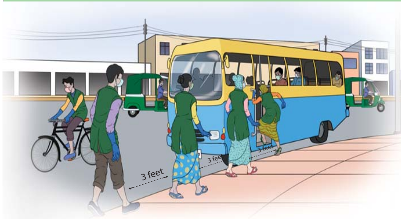
While using public transport.